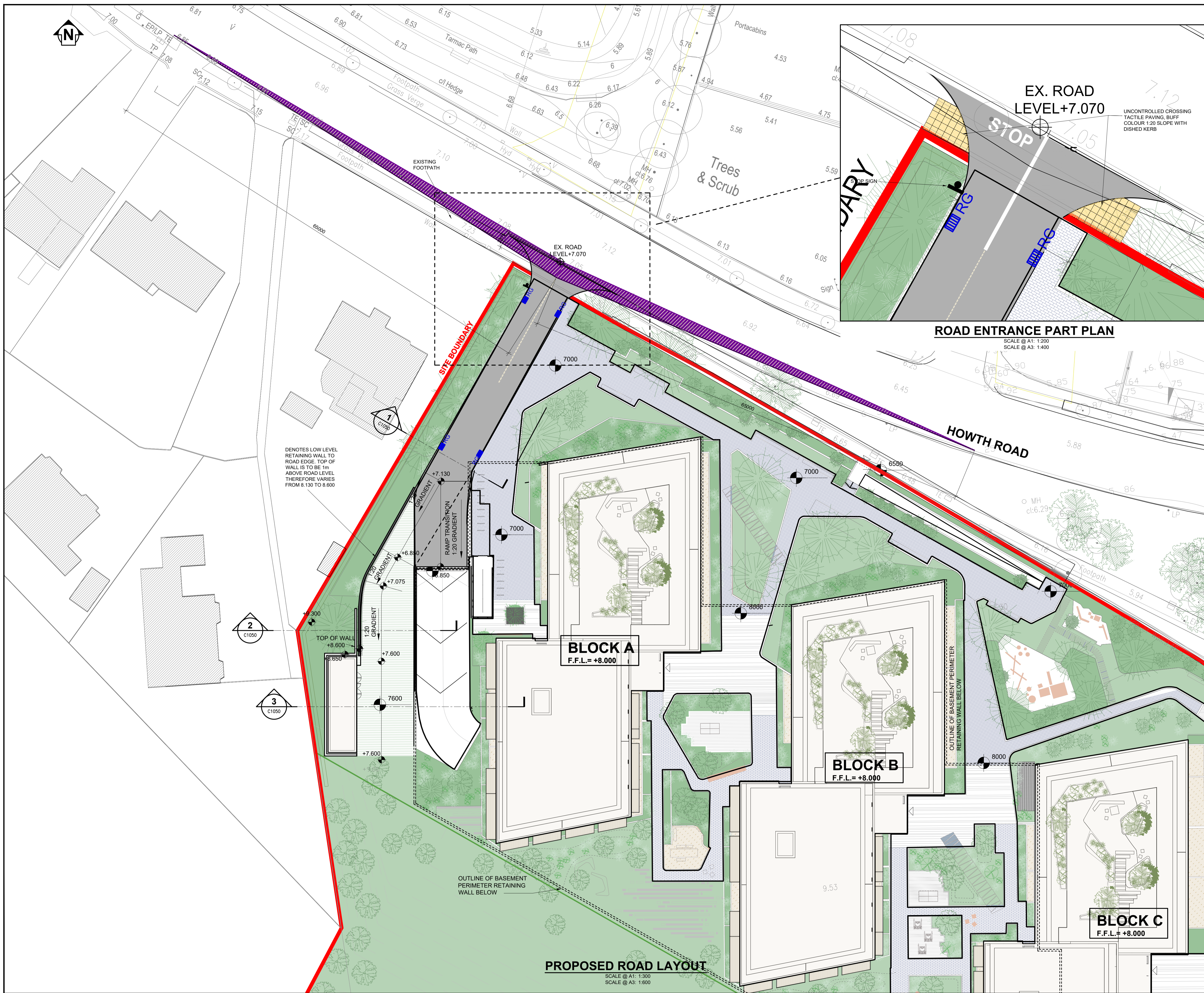
PROPOSED ROAD LAYOUT